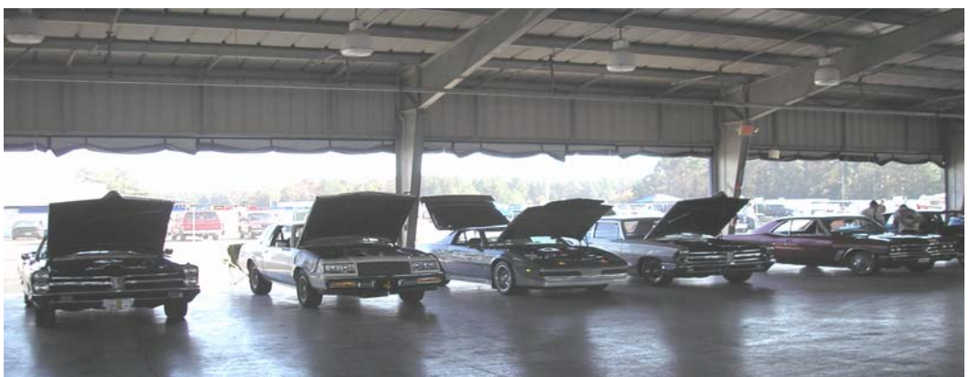
Good variety of BOP