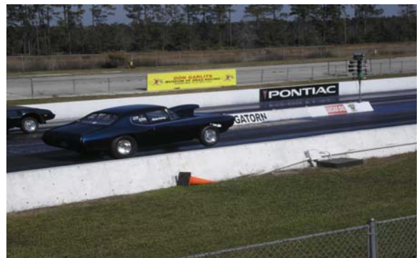
A 9 Second GOAT