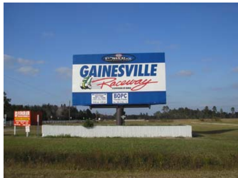
Gainesville Raceway Entrance

This show took place back in December 2007. The event included a car show, drag racing and a swap meet area. Gainesville is about 4 hours away, but it was worth the drive.