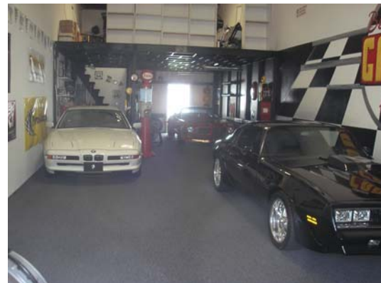
Room for more cars!