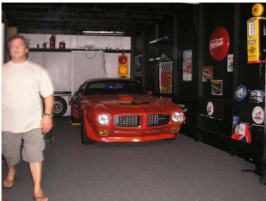
The proprietor and one of his rides